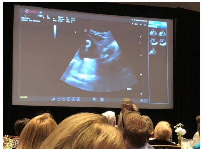
The Room was filled from one end to the other...