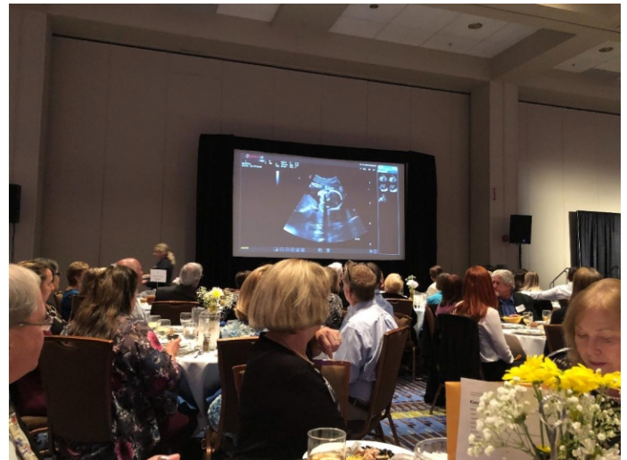
The "Live" Sonogram was a huge crowd pleaser...

Kiwanis is in the business of taking care of the Children of the World...our job?...to make sure the Children of OUR World are taken care of.