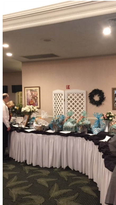
The Silent Auction not only looked impressive, it was a highlight of the evening