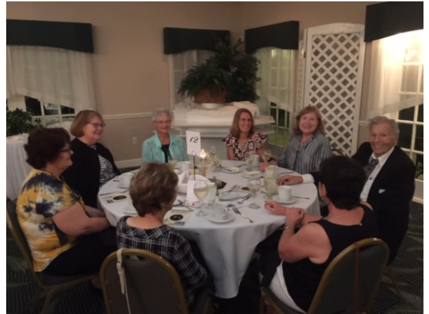
Members and their guests enjoying the evening

A huge thank you to all the members who work non-stop to bring these events to light and pull this "Little Club That Could" through yet another great evening in Flagler County.