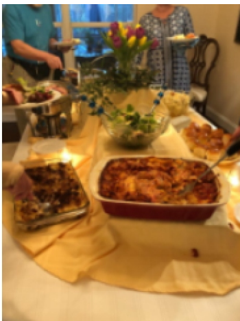
Just a Sample