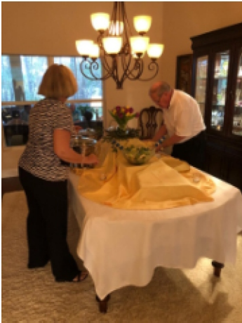
The Dynamic Duo Hard at Work