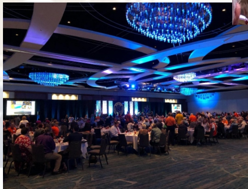
The ROOM WAS BEAUTIFUL. THE FOOD WAS GREAT. THE SERVICE WAS SUPERB. IT WAS HARD TO BELIEVE THEY COULD SERVE THAT MANY PEOPLE ALMOST AT THE SAME TIME