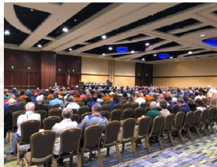
The House of Delegates was up and running very early ...