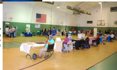
The Carver Gym was hoppin" Saturday for the Health and Safety Fair. Many a free book changed hands