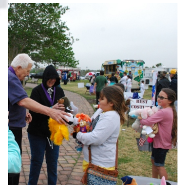
With open arms...