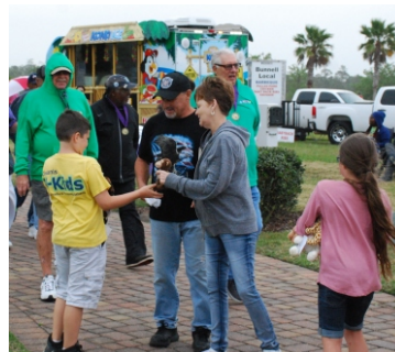
Another stuffed animal finds a new home