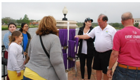
The medallions are at the ready