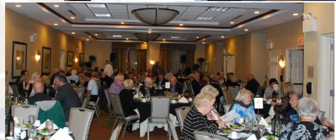
There weren't many empty seats as you can see...