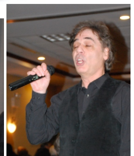
The Star of the Show!!